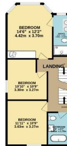
1ST FLOOR 605 sq ft. (56.2 sq.m.) approx.